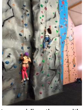
parents providing them with and activities to work with

· See current Accessibility Plan on school Web site