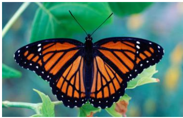
fly like a butterfly