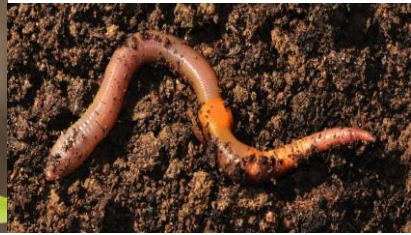
slither like a worm