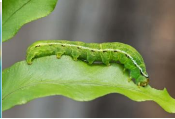
crawl like a caterpillar