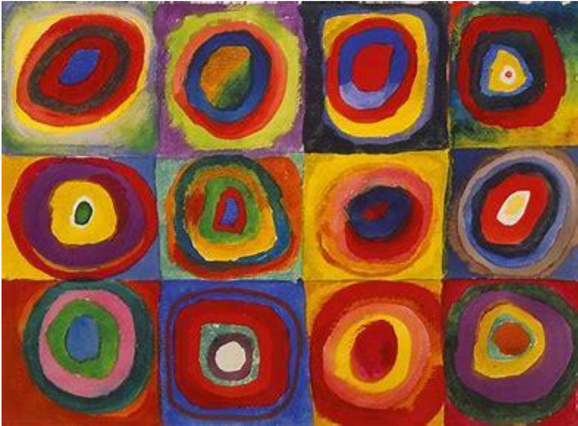
'Squares with concentric circles'